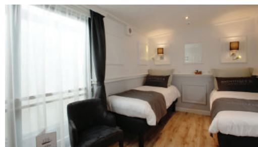
Upper Deck Suite with French Balcony

Suites, twin beds, small sitting area, French balcony with floor-to-ceiling sliding glass doors.