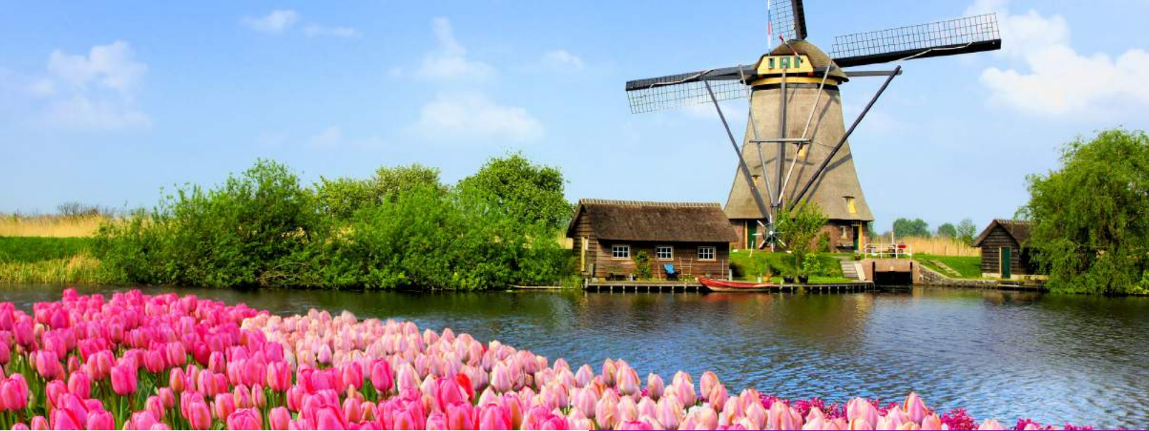
Kinderdijk, Holland (above); Cover: Ghent