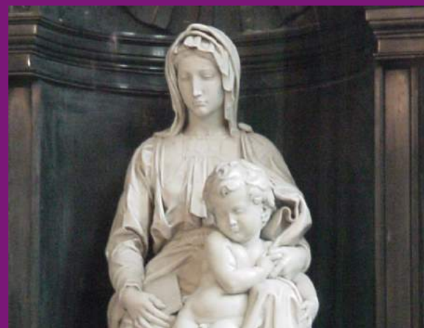
Michelangelo's Madonna & Child, Bruges, Belgium

War. In 2000 and 2001, he served as a senior official in the U.N. mission in East Timor and concurrently as a cabinet minister in East Timor's first government with responsibility for negotiations on issues resulting from East Timor's independence. Currently, he is the Senior Diplomatic Fellow at the Center for Arms Control and Non-Proliferation, and his most recent work focuses on the war in Syria. Ambassador Galbraith has served as Study Leader on many Harvard Alumni travel programs and lectures on a wide variety of topics.