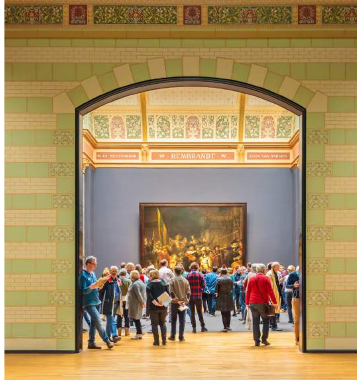
Regional map (left) and Rijksmuseum, Amsterdam, Holland (right)