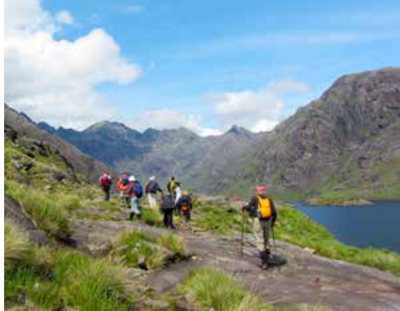
Tobermory, Isle of Mull (left) and Loch Coruisk, Isle of Skye (right). Cover: Isle of Staffa.