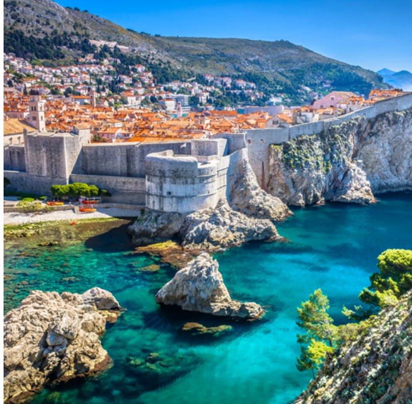
Right photo: Dubrovnik