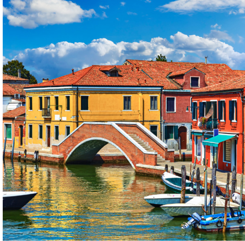
Left photo: Roman Forum, Zadar / Right photo: Venice, Italy