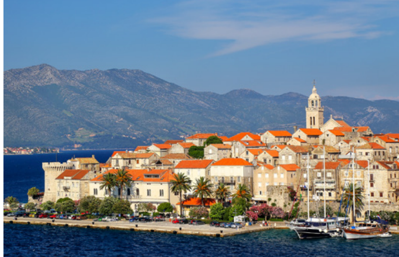
Left photo: St. Nicholas Fortress, Šibenik / Right photo: Korčula